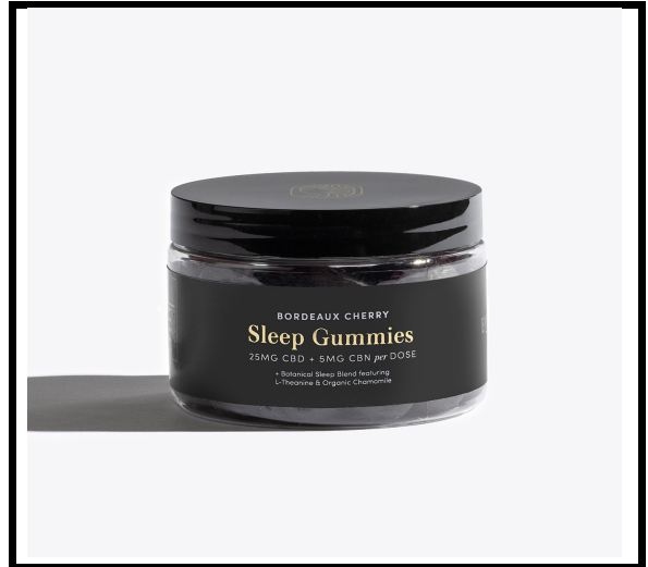
750mg CBD Equilibria Extra Strength Gummy Bordeaux Cherry (60ct.)